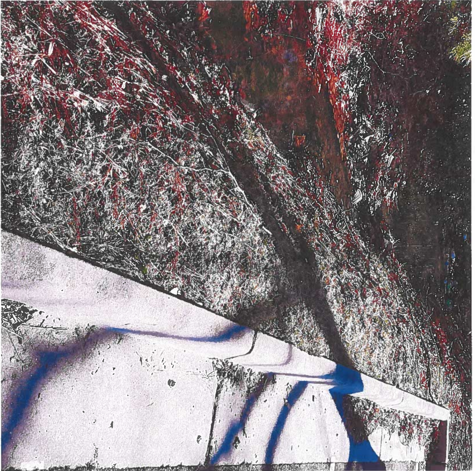
View looking towards R+13