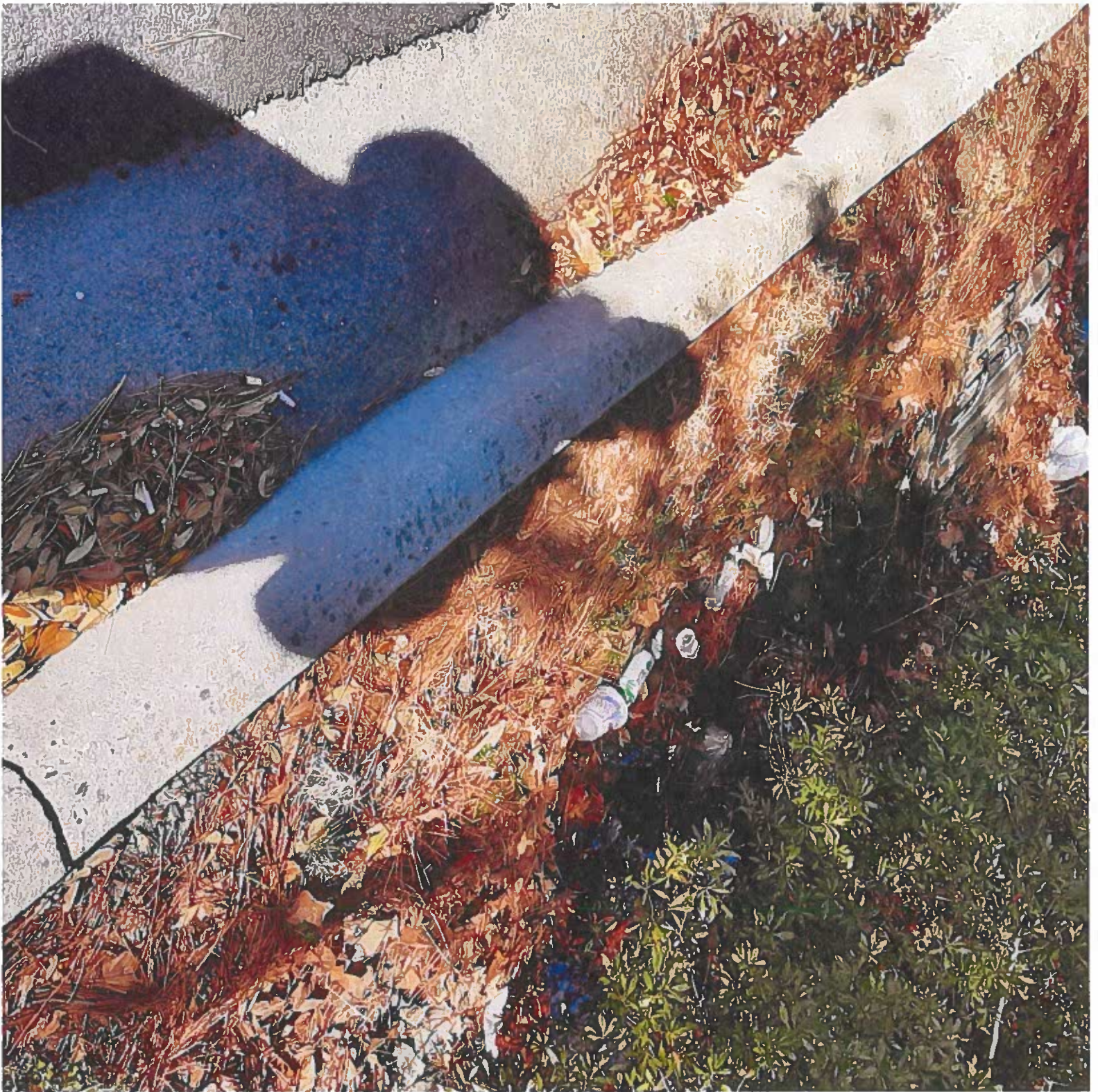
View looking towards Rt 609 Redwood Rd.